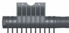
Detail for remote exhaust connection showing plug and tube adapter fitting.